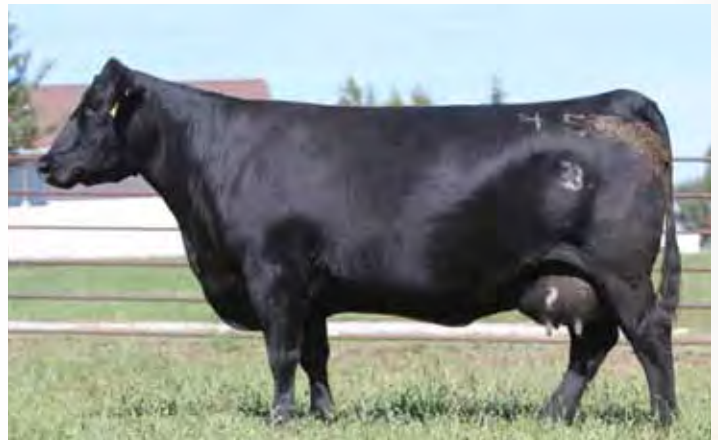
E&B Lady Reserve 455 - Dam of Lots 136-137 and 143-144