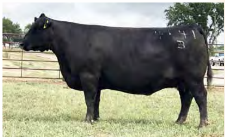
E&B Lady Consensus 4141 - Donor Dam of Lots 40-45

*Recommended for virgin heifers or cows. *Top 10% CED bull with top 4% WW and top 2% YW. *This bull is a real good one with exceptional length and thickness.