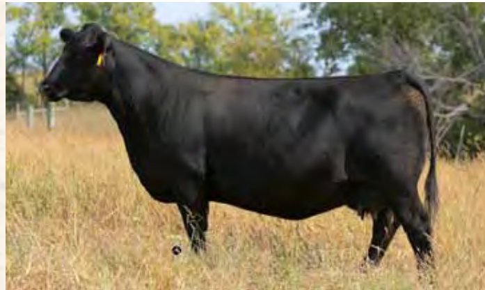
E&b Lady Payweight 7177 - Dam of Lot 70

*Recommended for virgin heifers or cows. *2156 is an absolute stud with excellent look and a tremendous epd package. *Top 1% $Maternal, and $Wean with a top 10% $Combined. *Dam has been a top producer with wr 4/109 and she is an elite pathfinder dam.