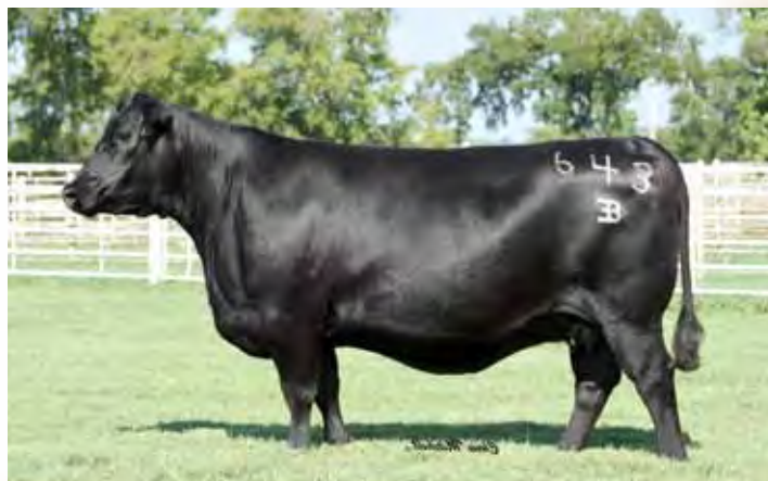
E&B Lady Plus 643 - Dam of Wildcat

*Recommended for virgin heifers or cows. *A well made, well bred Wildcat son with excellent growth and carcass numbers. *Dam is doing well at 9 years old with super udder and great feet.