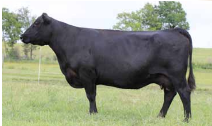
E&B Lady 7229 Consensus 3139 - Dam of Lot 34