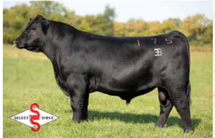
E&B Rival 175 - Maternal brother to Lot 120

*This Rawhide son is super looking and powerful with a top 3% $M and $W, top 10% $B and top 3% $C. *Dam, is a pathfinder and is also dam of our highest selling bull ever in E&B Rival who was purchased by Select Sires in our 2022 sale.