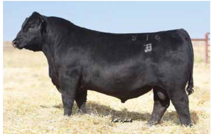
E&B Plus One - Maternal brother to Lot 162