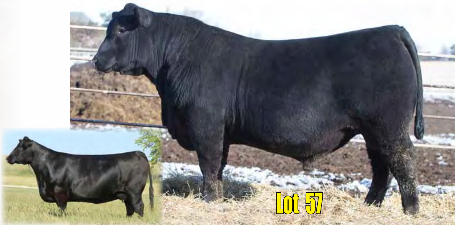
E&b Lady Plus 517 - Dam of Lot 57 & 58