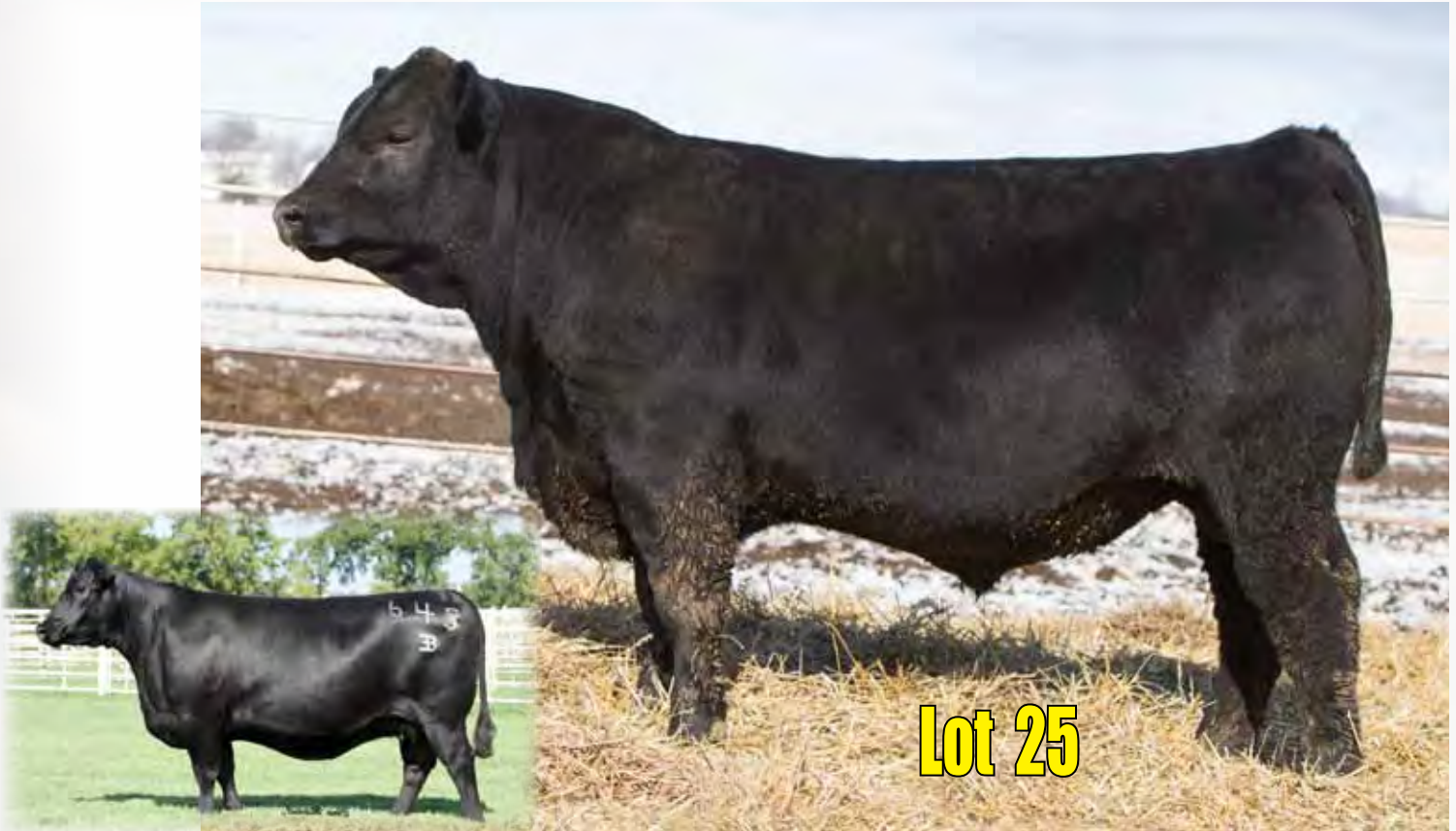
E&B Lady Plus 643 - Dam of Lots 25-28 and Wildcat